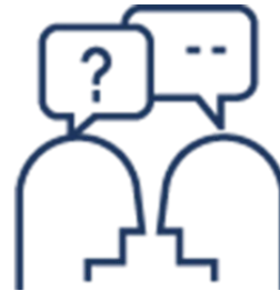
FIPA and AI Regulation