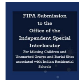
FIPA Submission to the Special Interlocutor