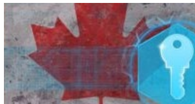
File No. 40078 Supreme Court of Canada Intervention