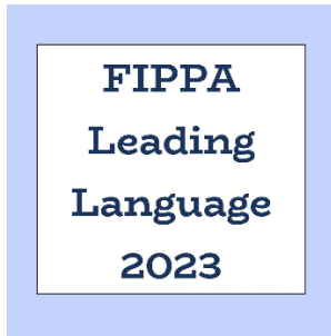
Leading Language 2023