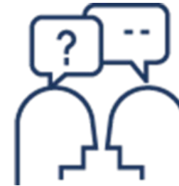
FIPA and the Right 2 Your Face