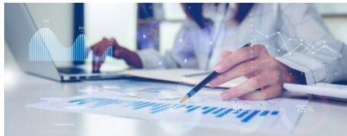
Get Help Relaunch