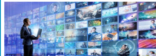
FIPA News Monitoring