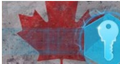
FIPA for Teachers