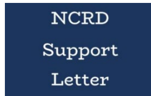
Supporting National Claims Research Directors